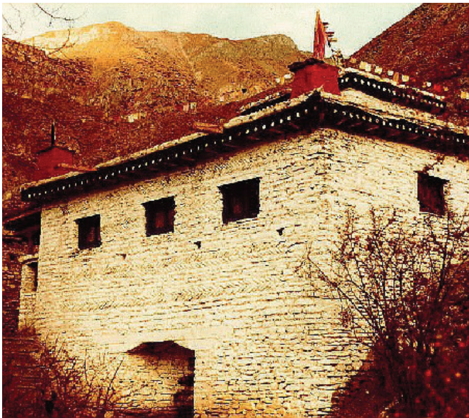
The "Temple Of Miraculous Fire" at Muktinath, Nepal. Photo by Ken Street (Nov. 1979).

[For more on this subject, please read our tract The Temple Of Miraculous Fire .]